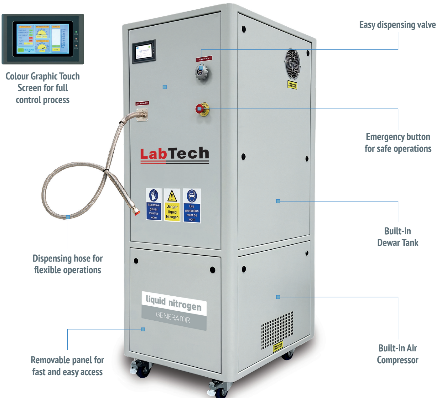
Colour Graphic Touch Screen for full control process

Experience first hand the convenience of having the generator in your lab without delivery hassles!